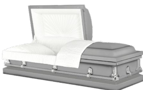
Ariel Available in Silver, Blue, Copper, Orchid, and White