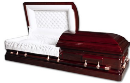
Cardinal Also Available in Red or White